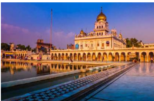
Gurudwara Bangla Sahib